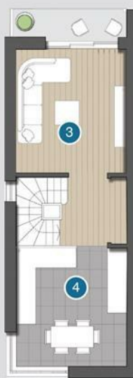
FIRST FLOOR Area 37.7m 2 (405.80 ft 2 )