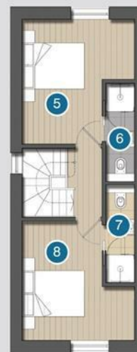
SECOND FLOOR Area 37.7m 2 (405.80 ft 2 )

Council Tax Band D. The amount payable under tax band D for the year 2024/2025 is £2,196.77.